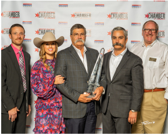
Spindletop Honoree: Broussard's

The Spindletop Award is distributed each year at our annual meeting. It was created in 1999 to recognize larger area businesses for outstanding corporate citizenship and overall impact on our community. A committee consisting of Board Members and past chairs of the Greater Beaumont Chamber of Commerce chooses the award recipient to receive this honor at the annual meeting.