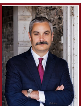
Blue Broussard Broussard's Mortuary