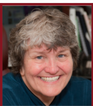
Paula Bothe Four Alarm Productions